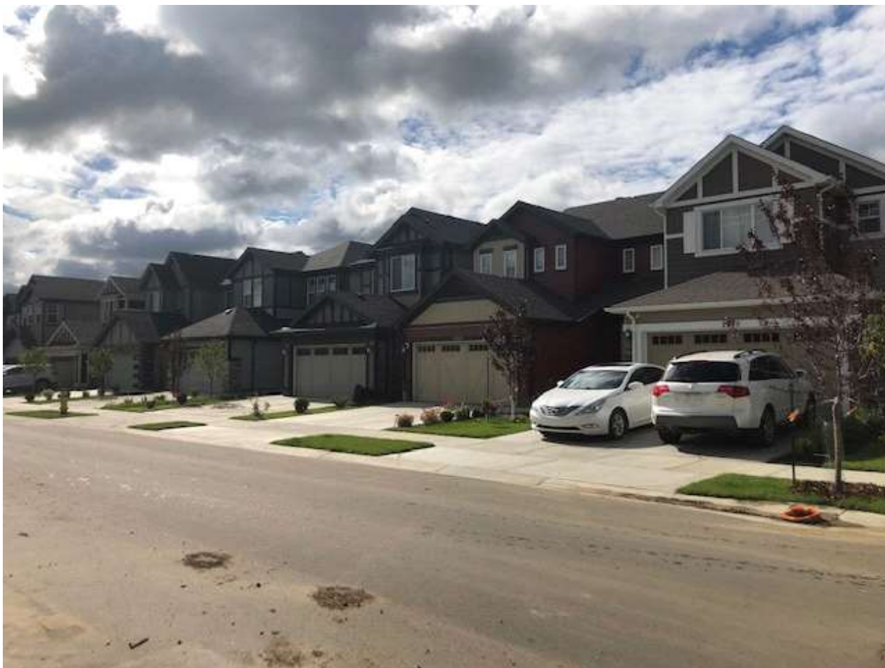
Figure 3: Zero Lot Line Homes with Front Attached Garages, No Boulevard