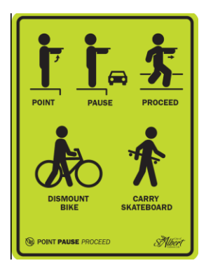
Figure 1: Draft Point, Pause, Proceed and Dismount Sign – Non-Signalized Locations