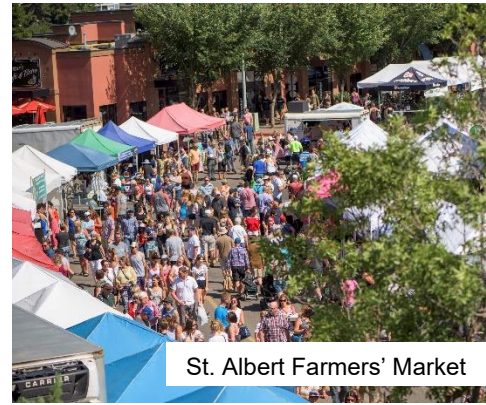
St. Albert Farmers' Market