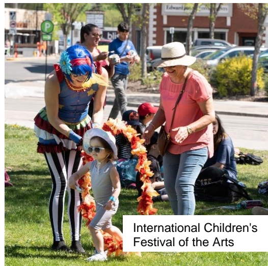
International Children's Festival of the Arts