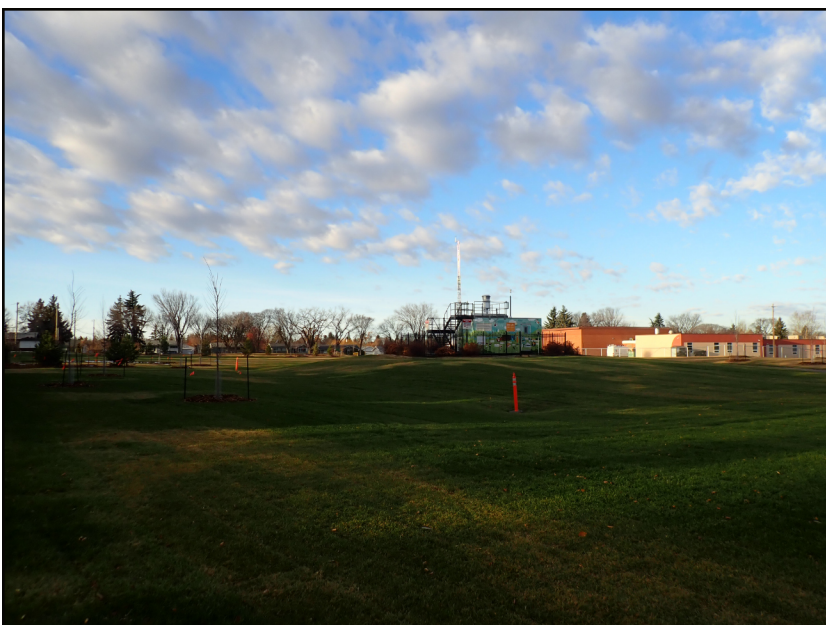
Photo 3 Looking at the Air Quality Monitoring Station on 37 Sunset Boulevard. Holy Family School is in the background.