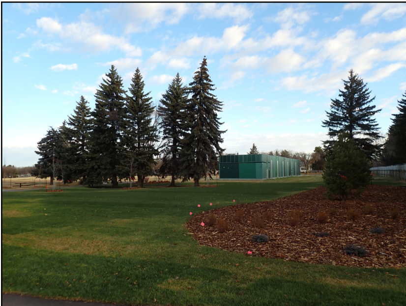
Photo 2 Looking at the back of the Sturgeon Reservoir and Pump Station Building, including landscaping.