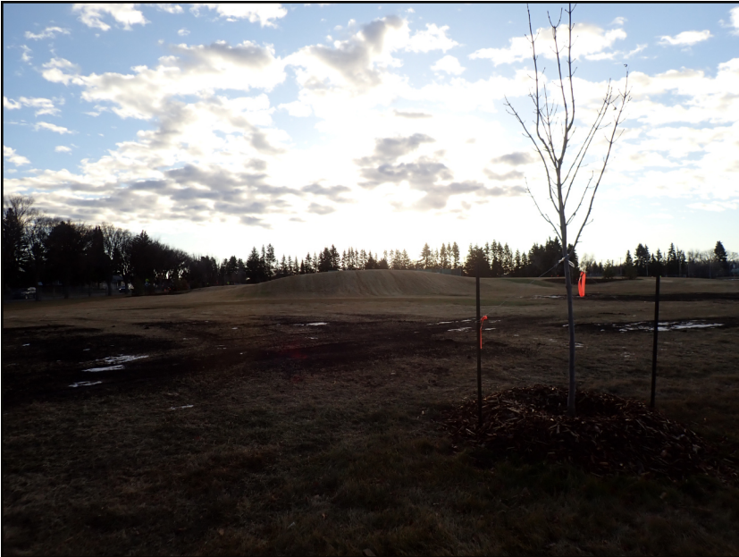
Photo 5 Looking at the topography and landscaping on 53 Salisbury Avenue.