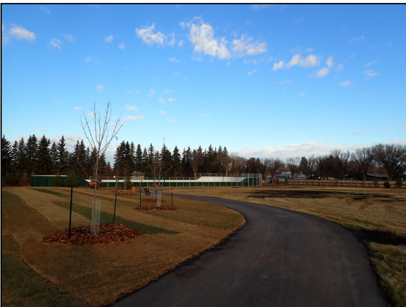
Photo 6 Looking at the outdoor rink on 81 Salisbury Avenue, and new landscaping added along the pedestrian path through the site.